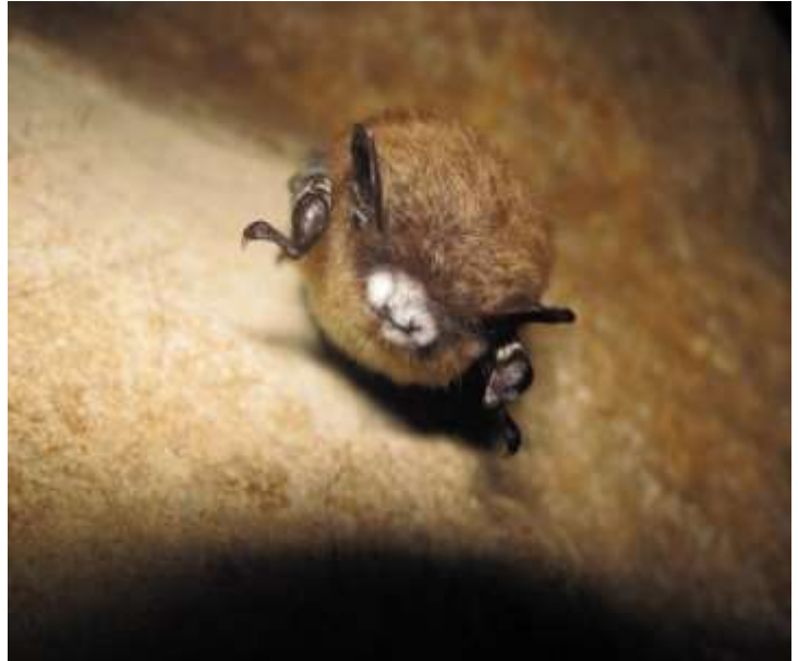
Micro bat from US Cave