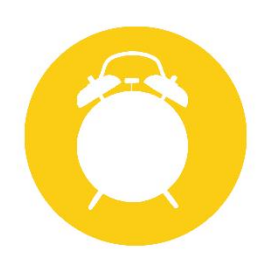
Course Duration 12 months