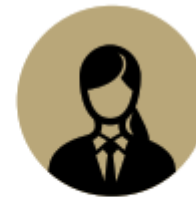
Practice owners / principals